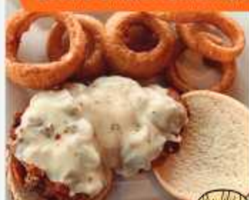
Buffalo Chicken Sandwich

Fresh, house-made meatballs on a French hoagie roll, topped with house-made marinara and melted mozzarella. Served with chips. 10.99