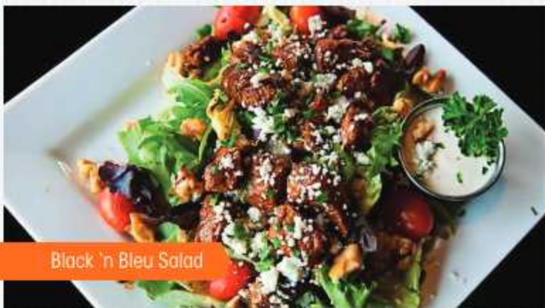
Black 'n Bleu Salad